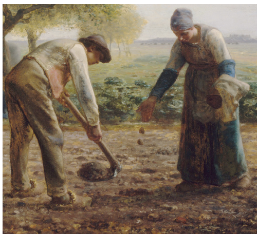
Peasant and Peasant Woman Planting Potatoes, Vincent van Gogh

Today, people of every generation – especially the millennials and Generation Z – want to know if it's possible to change a system that causes misery, inequality, wars. Can we stop the devastation of our planet? People want all of humanity to share in the benefits the human race has achieved. Can we create a system that puts people before profits?