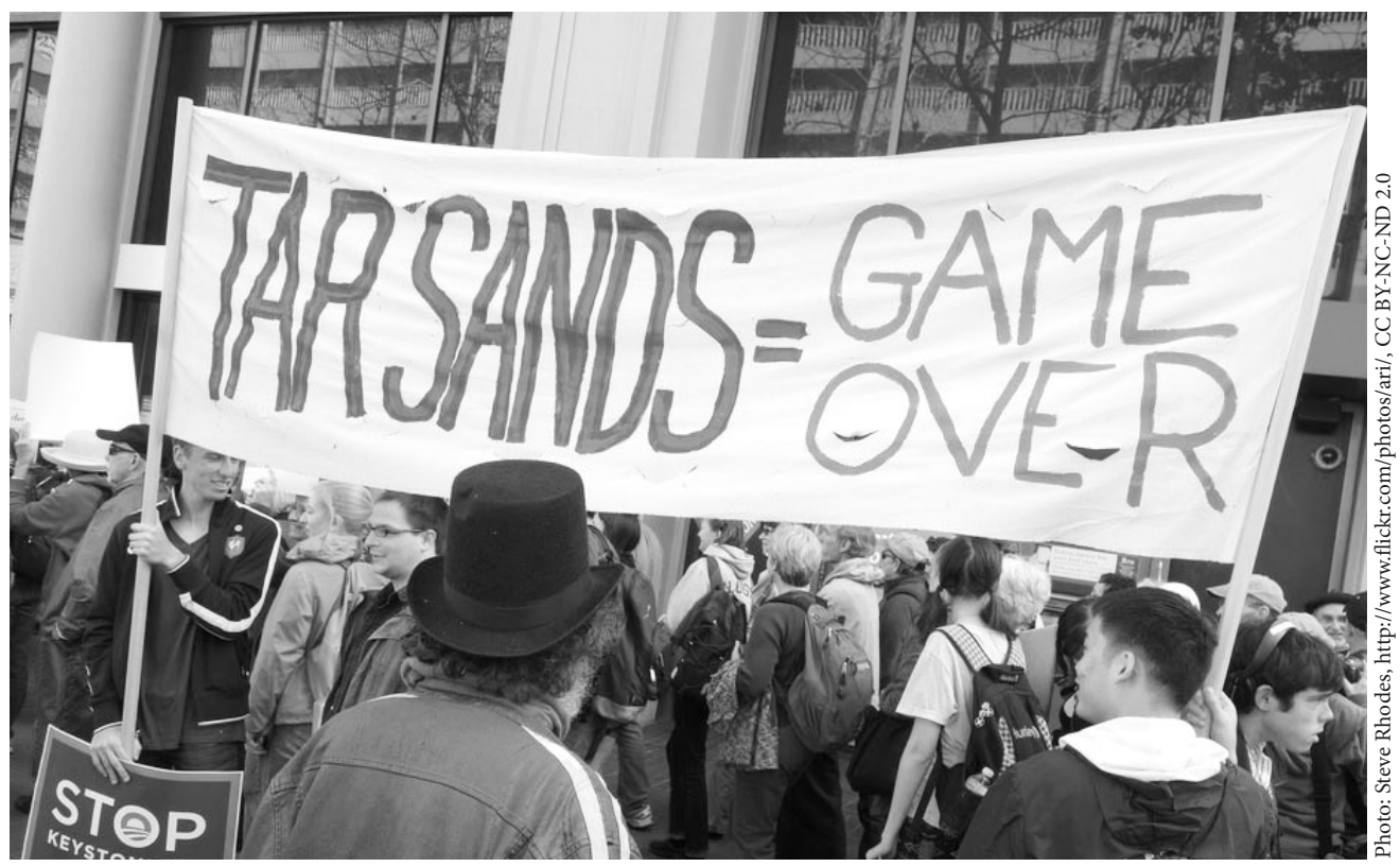
Protests against Keystone XL pipeline at State Dept. Bldg, San Francisco, Feb 17, 2013.

The Keystone pipeline is part of ever increasing efforts by global corporations to exploit resources